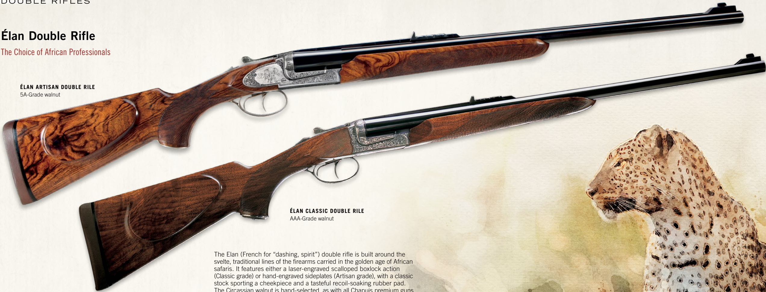
ÉLAN CLASSIC DOUBLE RILE AAA-Grade walnut

The Elan (French for “dashing, spirit”) double rifle is built around the svelte, traditional lines of the firearms carried in the golden age of African safaris. It features either a laser-engraved scalloped boxlock action (Classic grade) or hand-engraved sideplates (Artisan grade), with a classic stock sporting a cheekpiece and a tasteful recoil-soaking rubber pad. The Circassian walnut is hand-selected, as with all Chapuis premium guns.