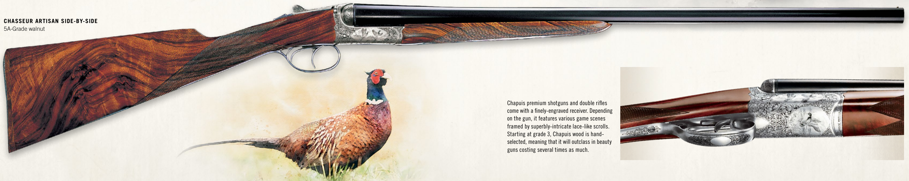
CHASSEUR ARTISAN SIDE-BY-SIDE 5A-Grade walnut

Chapuis premium shotguns and double rifles come with a finely-engraved receiver. Depending on the gun, it features various game scenes framed by superbly-intricate lace-like scrolls. Starting at grade 3, Chapuis wood is hand-selected, meaning that it will outclass in beauty guns costing several times as much.