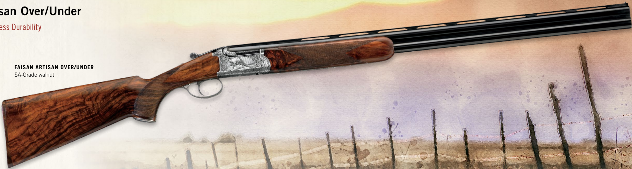
FAISAN ARTISAN OVER/UNDER 5A-Grade walnut

The Faisan (French for “pheasant”) is designed to achieve two goals: offering you the perfect and most functional upland over/under while making you stand out for the beauty of the premium-grade wood and the uniqueness and prestige of the brand you carry. The action of the Faisan is built from a single block of forged steel for maximum resistance and durability. And the action’s profile is low, meaning that your supporting hand will be very close to the bore axis for instinctive pointability under most hunting circumstances.