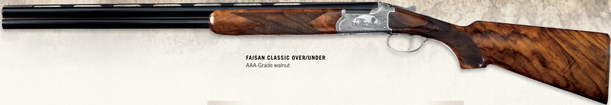
FAISAN CLASSIC OVER/UNDER AAA-Grade walnut

The Faisan (French for “pheasant”) is designed to achieve two goals: offering you the perfect and most functional upland over/under while making you stand out for the beauty of the premium-grade wood and the uniqueness and prestige of the brand you carry. The action of the Faisan is built from a single block of forged steel for maximum resistance and durability. And the action’s profile is low, meaning that your supporting hand will be very close to the bore axis for instinctive pointability under most hunting circumstances.