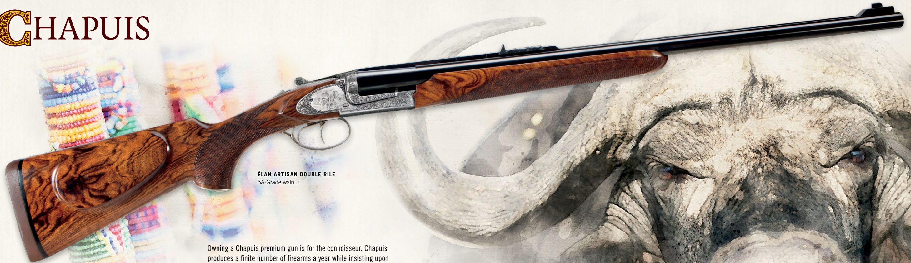
ÉLAN ARTISAN DOUBLE RIFLE 5A-Grade walnut