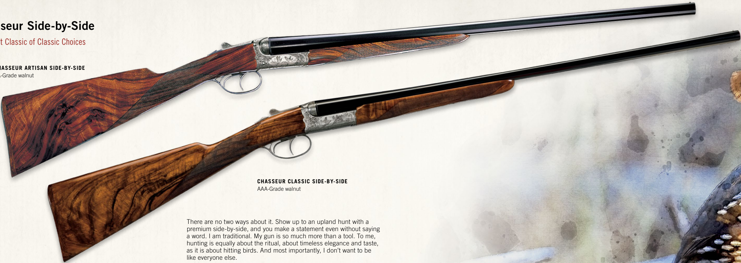
CHASSEUR CLASSIC SIDE-BY-SIDE AAA-Grade walnut

There are no two ways about it. Show up to an upland hunt with a premium side-by-side, and you make a statement even without saying a word. I am traditional. My gun is so much more than a tool. To me, hunting is equally about the ritual, about timeless elegance and taste, as it is about hitting birds. And most importantly, I don't want to be like everyone else.